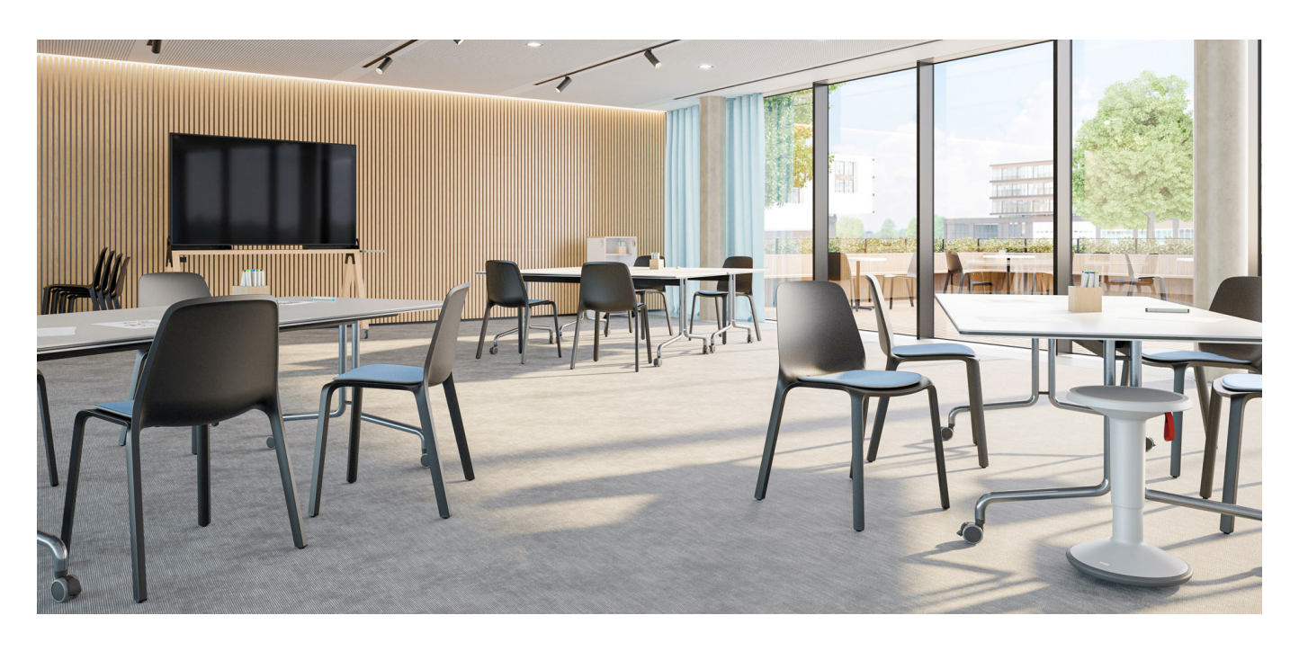
MONO - AWARDED THE GERMAN DESIGN AWARD

MONO was presented for the first time at ORGATEC 2022 in Cologne and has since received the German Design Award, Winner category, from the German Design Council.